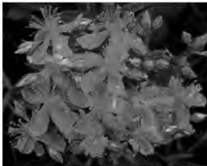
Figure 7. Creeping St. Johnswort ( Hypericum adpressum ) at South Fork Natural History Museum.

Now for the main event! Eric assured me that I would be certain to see my first fringed orchid with yellow flowers at Lazy Point (off Lazy Point Road off Cranberry Hole Road), Napeague, East Hampton Township and I was NOT disappointed. We saw dozens of plants of pale fringed orchid in peak bloom growing in sand and needle litter in partial to full shade within small groves of pitch pine. Dozens more were still in bud, and in some areas the inflorescences of many plants had been browsed off by some orchid-loving herbivore, likely a white-tailed deer. Patches of salt marsh bordering rolling dunes provided habitat for twig rush, a few blooms of sea pink, sundrops and bitter panicgrass, the latter three new to me. Many beach plum shrubs bearing green fruit grew on the open sand.